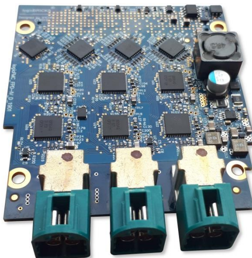
Figure 3: Xylon FMC Card with the Rosenberger Quad HFM High-Speed FAKRA-mini Connectors

Provides all voltages necessary for a proper FMC card's operation. Integrated regulated power supply enables software controller powering of different camera types.