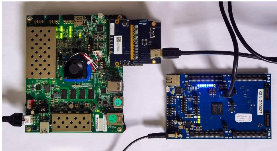
Figure 1: logiHSSL-ZU FPGA HSSL Starter Kit

Fallerovo setaliste 22 10000 Zagreb, Croatia Phone: +385 1 368 00 26 Fax: +385 1 365 51 67 E-mail: support@logicbricks.com URL: www.logicbricks.com